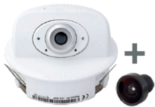
p26 camera body und lenses B036 to B237 for self-mounting